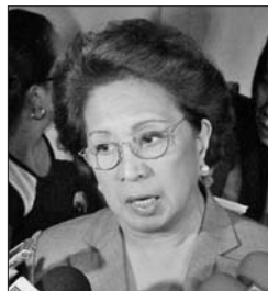
The newly-appointed Ombudsman, former Supreme Court Associate Justice Conchita Carpio-Morales

Lacierda said the Ombudsman "must be independent, one of unquestionable integrity, and willing to face the rigorous task of restoring faith in our recovering institutions by ensuring that the corrupt are held accountable for their misdeeds" and that "guided by these, President Aquino has appointed Conchita Carpio-Morales as the new Ombudsman."