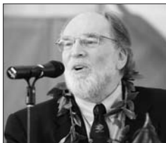
Gov. Neil Abercrombie

The Rural Outreach Services initiative is a public-private partnership supported by the