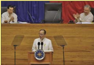
Senate President Juan Ponce Enrile and Speaker Feliciano Belmonte applaud as President Aquino delivers his second SONA.

"The speech of the President was good and inspiring because he said we have the power of change. We all can do it," Belmonte told reporters, noting that the