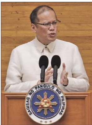
President Benigno Simeon "Nonoy" C. Aquino III

"There was a time when we couldn't appropriately respond to threats in our own backyard," Aquino said. "Now, our message to the world is clear: What is ours is ours; setting foot on Recto Bank is