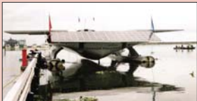
The M/S Türanor Planet Solar, the world's largest and most advanced solar-powered boat, is docked for a welcoming ceremony at the Philippine Navy headquarters yesterday. The multi-hulled catamaran is in Manila in its continuing voyage from Monaco in an attempt to circumnavigate the globe using only solar power.