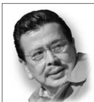
Former Pres. Joseph "Erap" Estrada