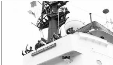
The BRP Gregorio del Pilar, the Philippines' biggest and newest warship