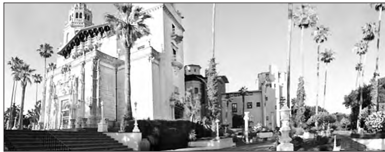
The main house of the Hearst Castle Estate

As we glided through the main house, we could almost hear the echoes of past festivities reverberating through its walls as our tour guide mentioned the extravagant parties, the lavish outlay of wine and culinary masterpieces for the Hollywood royalty and other famous people who set foot in