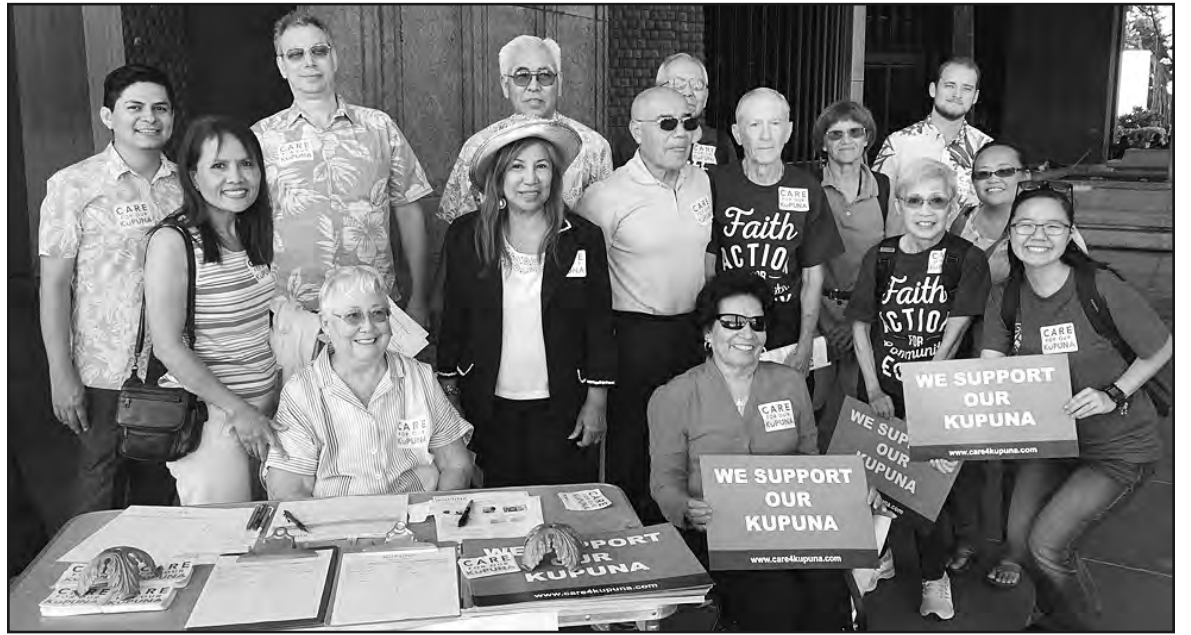
Caregivers and advocates show their support for the passage of the Kupuna Caregiving Assistance bills during a rally at the State Capitol last February 7.