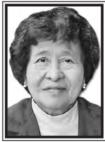
DAYASADAS By Pacita Saludes