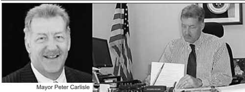
Mayor Peter Carlisle