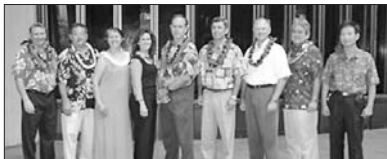
The SBA-Hawaii 2010 award winners

The required nomination forms for each of the ten categories of the Hawaii District Office awards can be found on-