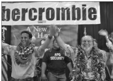
New leaders Lt. Governor Brian Schatz and Governor Neil Abercrombie

In addition to their desire to roll back healthcare reform and Wall Street reform as the GOP establishment stated, Tea Party members ultimately want to cut-