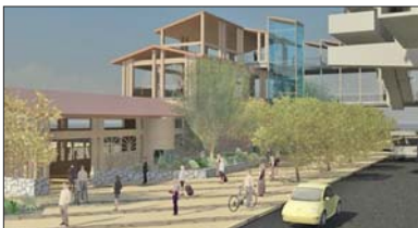
Waipahu Transit Center entrance

For updates on the Honolulu Rail Transit Project, check the project website at www.honolulurailtransit.org or con-