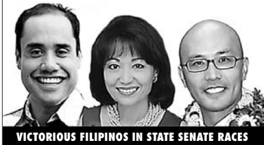
VICTORIOUS FILIPINOS IN STATE SENATE RACES

While Democrats suffered a major blow in the loss of the House majority, there may be a silver lining in the party's defeat. Americans could be optimistic that partisan gridlock might take