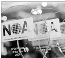
The Philippines is a consistent winner since 2007

Advocating best practice, the NOA represents outsourcing end-users, vendors and other companies, which support outsourcing such as legal firms, consultancies and HR. It