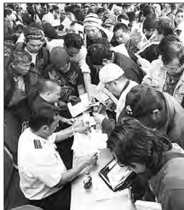
Repatriation of OFWs from Libya