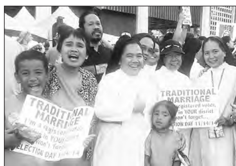
Filipino nuns and other church members rally at the State Capitol against the gay marriage bill, an issue that many Filipinos of the Roman Catholic faith staunchly opposed.