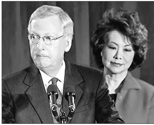
U.S. Sen. Mitch McConnell, a Republican from Kentucky, with his Asian-American wife Elaine Chao. Sen. McConnell credits her for helping him win re-election by a 56 percent to 41 percent margin