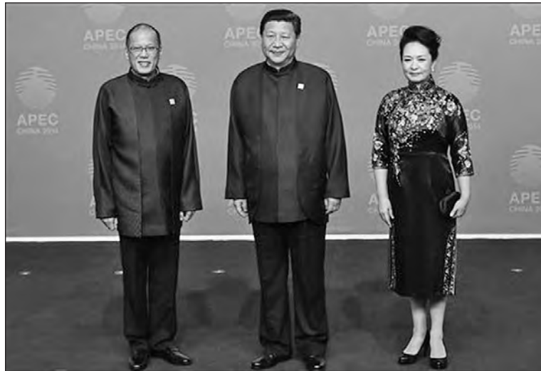
President Benigno Aquino III poses with Chinese President Xi Jinping who is hosting a welcome dinner for APEC leaders, and his wife Peng Liyuan, at the Beijing National Aquatics Center in Beijing, Monday, Nov. 10, 2014.

"To be honest, I was looking at it quite intensely. Assum-